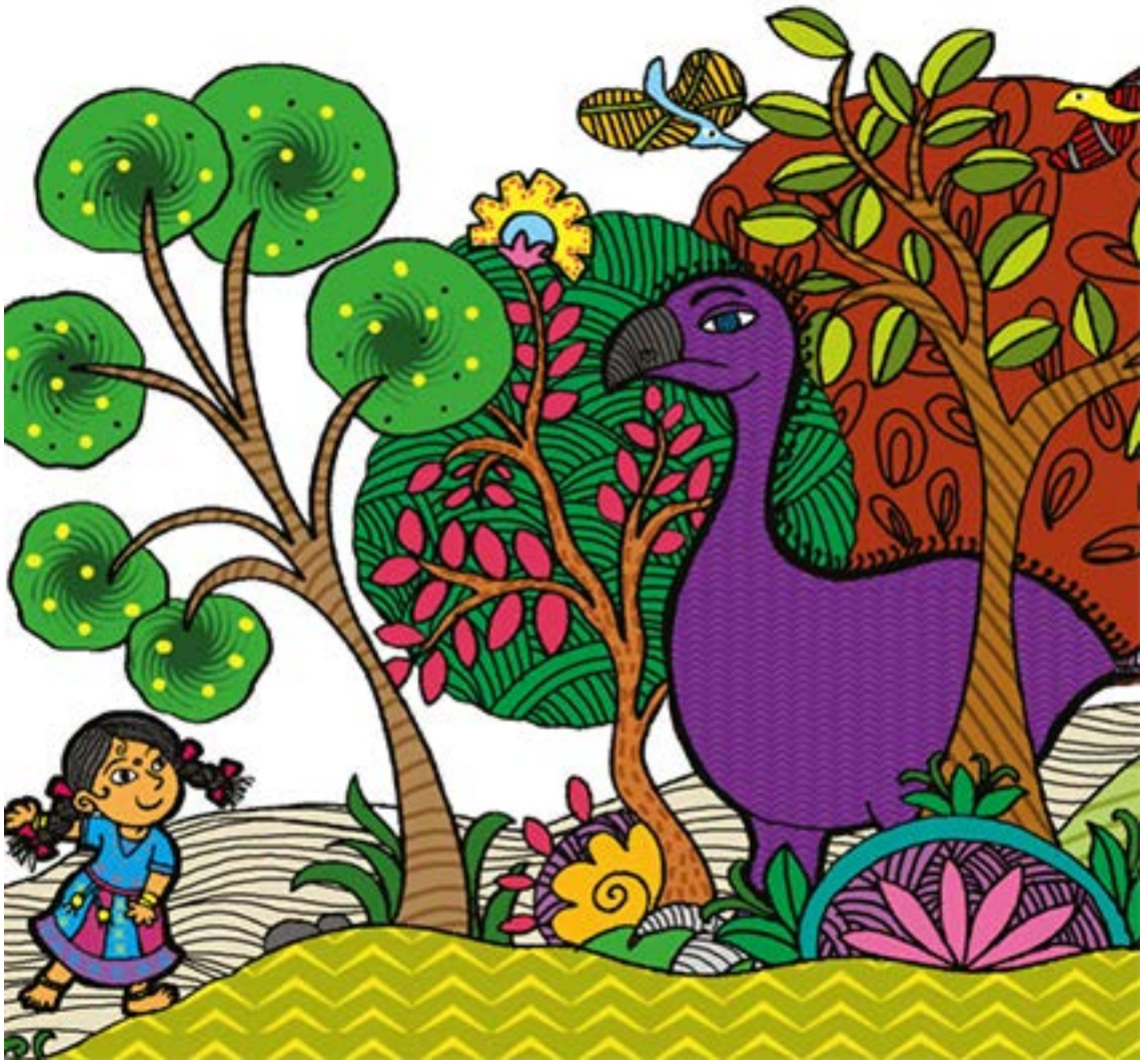
The elephant bird