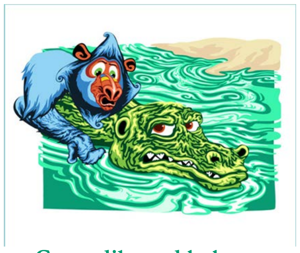
Crocodile and baboon